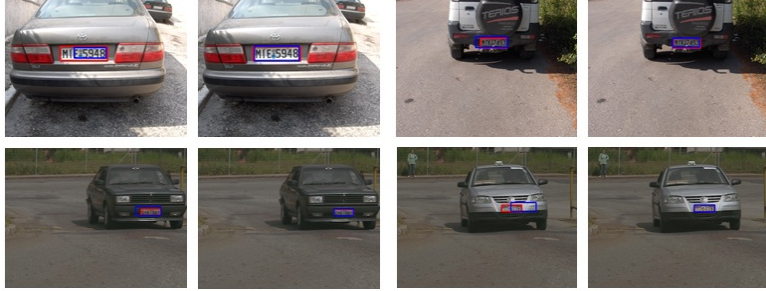
Fig. 2: Localization examples in the Greek (first row) and Brazilian databases (second row) for sliding window and local search stages. Red and blue windows stand for ground-truth and detected windows, respectively. Note that in some situations the windows are so precisely detected that red windows are overlapped by blue ones.

considered in our tests. The databases were manually labeled with rectangle bounding boxes containing the license plate. The matching degree between a positive response of our SVM classifier and the ground truth is calculated using the Jaccard’s coefficient between two windows d_1 and d_2 as J(d_1, d_2) = (d_1 \cap d_2)/(d_1 \cup d_2) . A protocol similar to the one used in [15], where the Jaccard coefficient is applied to compute the best match m(r; R) for a rectangle r to a set of rectangles r_0 \in R , defined as